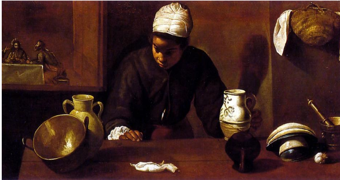
“Kitchen Maid With Supper at Emmaus” Diego Velazquez, c. 1618